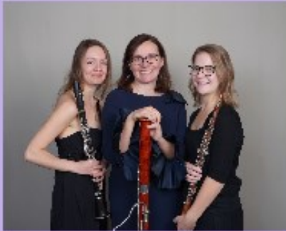
Sonora Winds Woodwind Trio February 13, 2022

All Concerts are at 1:00 pm at the Cathedral of Our Merciful Saviour 141 6th Street NW, Faribault MN