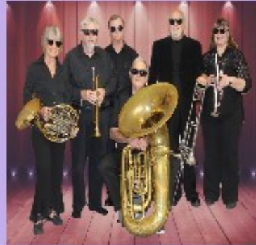
Alexander's Ragtime Brass Movie Music March 27, 2022

Tickets are $20 for the 2022 Season (Tickets can be purchased in the Cathedral Office, from a Cathedral Member or at the door before the performance)